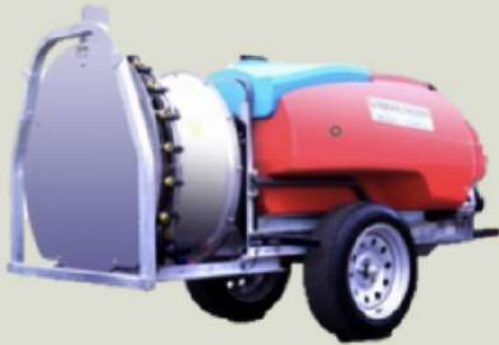
for use in agriculture