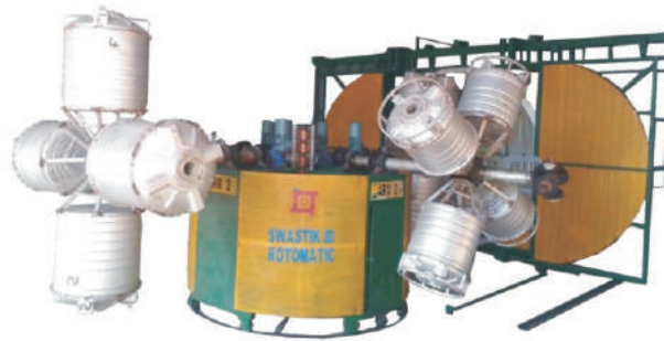
Four Arm Machine