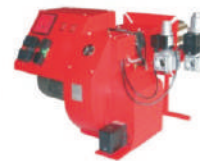
Burner (LPG / Diesel)