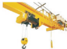
Motorised Crain with Structure