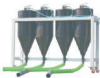
Powder dozer Syteam