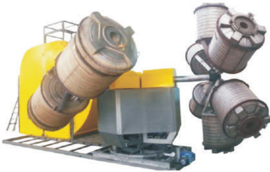
Three Arm Machine