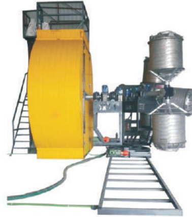
Two Arm Machine