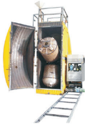
Single Arm Machine