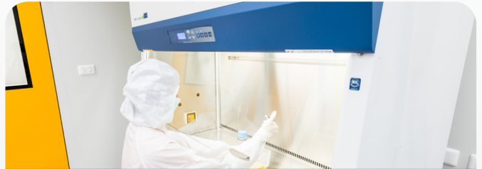
HEPA/ULPA CLEAN ROOM FILTER