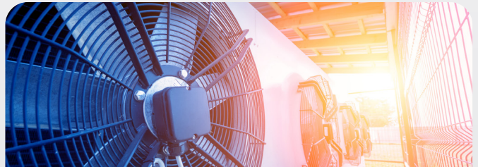
COMPRESSOR SUPPLY AIR FILTER