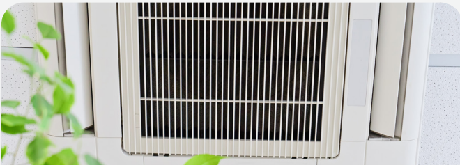
ROOM AIR FILTER