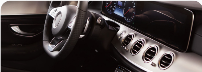
PASSENGER COMPARTMENT FILTER