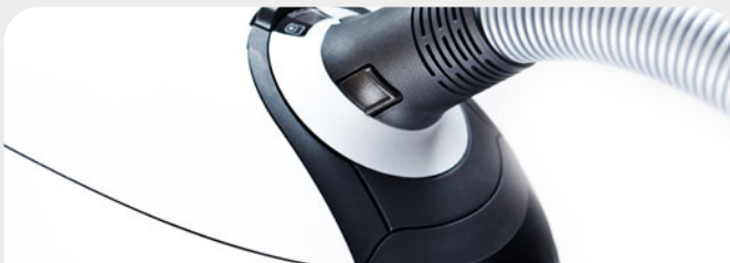
VACUUM CLEANER FILTER