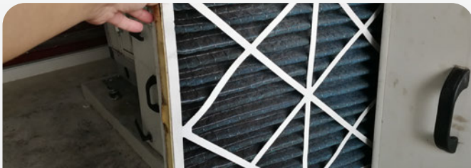
COMPRESSED AIR FILTER