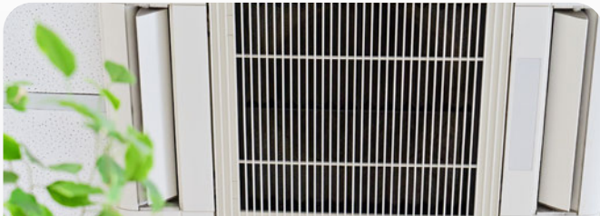
ROOM AIR FILTER