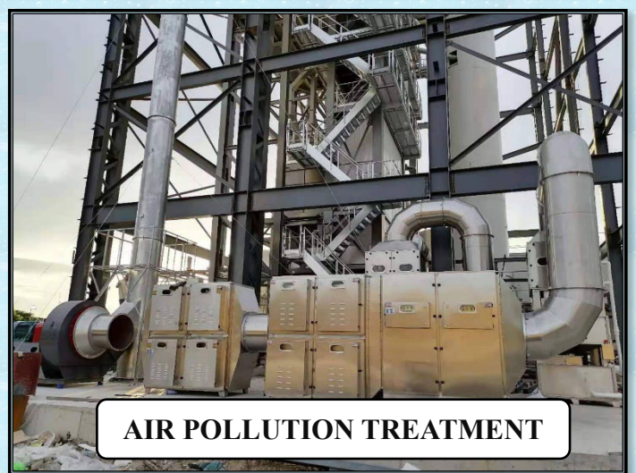
AIR POLLUTION TREATMENT