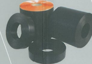
CUSHION GUM & SIDEWALL VENEER